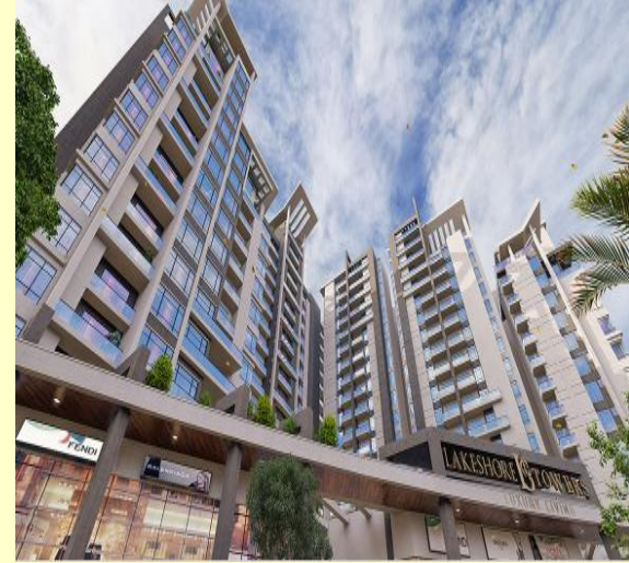
Lakeshore Tower at Top City-1.