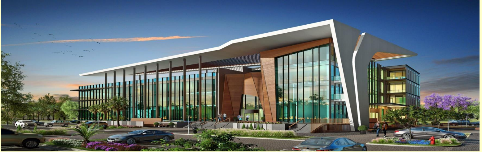
3D view of Sales Gallery at Capital Smart City