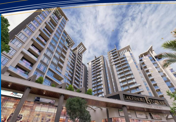
Structure and MEP Design of Lakeshore Tower at Top City-1 Islamabad by Designmen