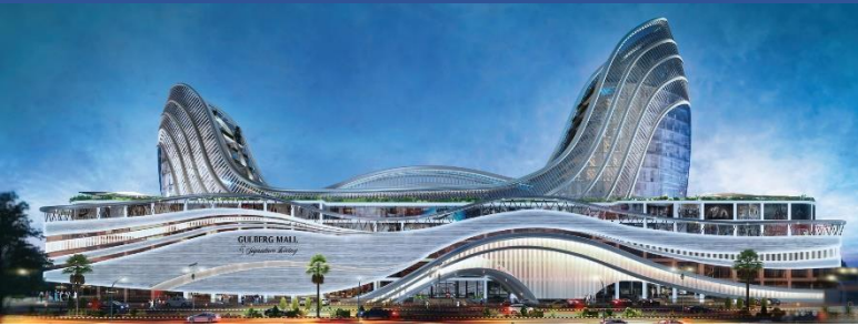
Vetting and Project Management of Mall of Gulberg & Signature Living by Designmen